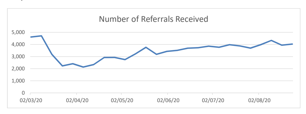
Graph 1 – New referrals received

Initially some services based on national guidance stopped referrals into their services for routine conditions and treatments. As part of the recovery and restoration work all services are now accepting referrals for all conditions from all referral sources. The only exception to this is in MSK and Wigan Adult Mental Health services, where patients are unable to self-refer at the present time. It is anticipated that patients will be able to self-refer in MSK services by the end of September and Wigan Mental Health services are reviewing this on a weekly basis with CCG colleagues.